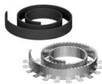
UNICOLLUM page 326