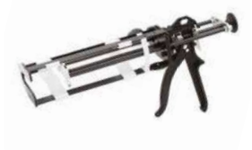
MAMMOTH DOUBLE page 400